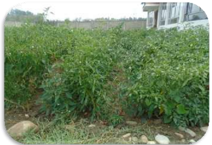
Crop: Chilli Variety: Kashmiri Long