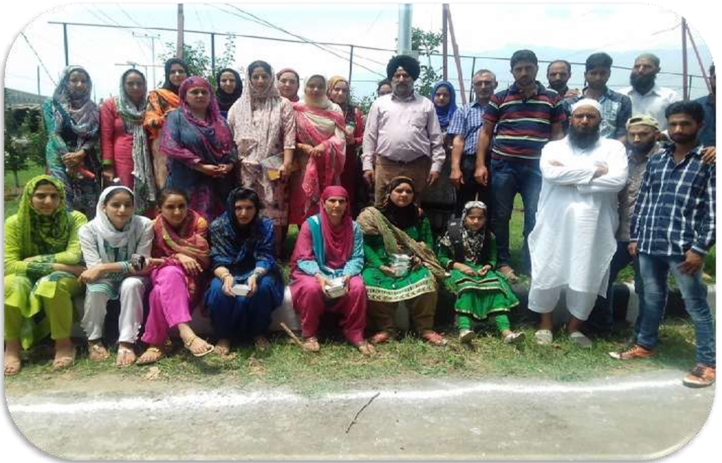
Farmers/Farm Women of KVK Srinagar attending Kisan Mela organized by SKUAST-Kashmir, dated on 07-07-2017.