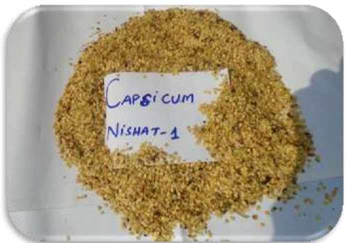
Vegetable Seed Production at KVK Campus