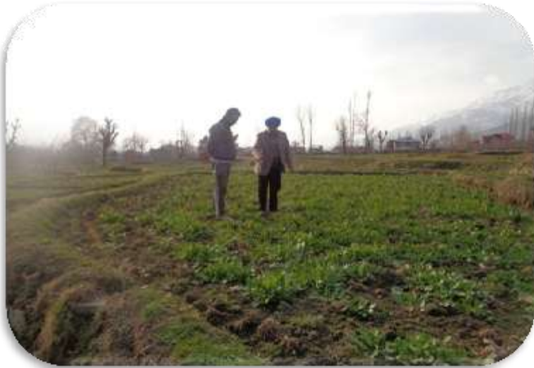
Monitoring of CFLD at village Darbagh