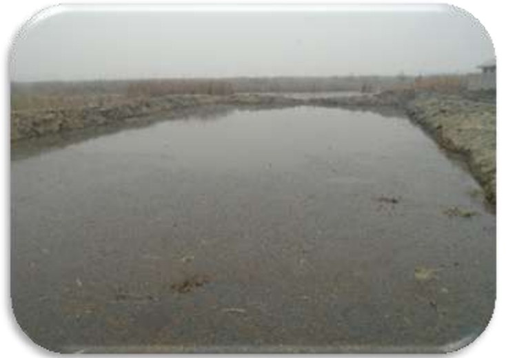
Establishment of Duckery Unit at KVK