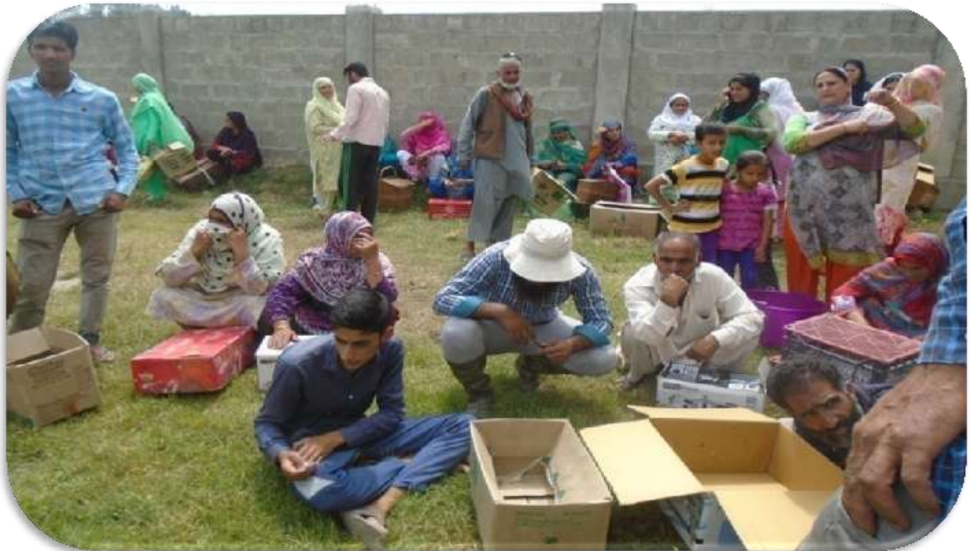
Farmers eager for receiving Poultry Birds at KVK Campus