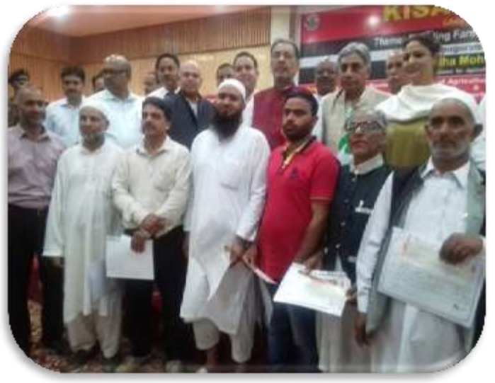
Farmers from KVK Srinagar receiving awards from Shri Radha Mohan, Hon'ble Union Agriculture Minister, Govt. of India.