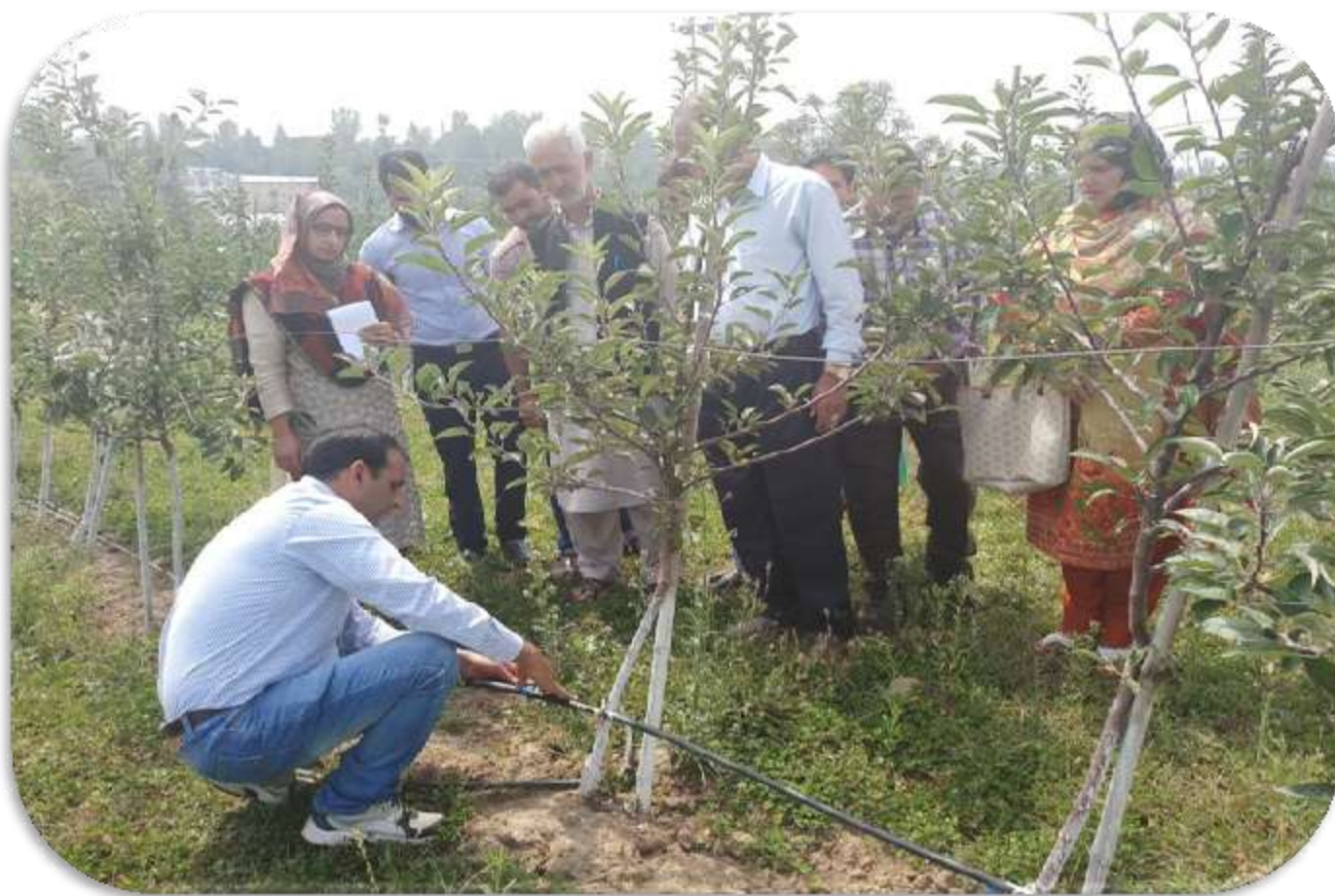
Farmers Training in Drip Irrigation at SKUAST-Kashmir