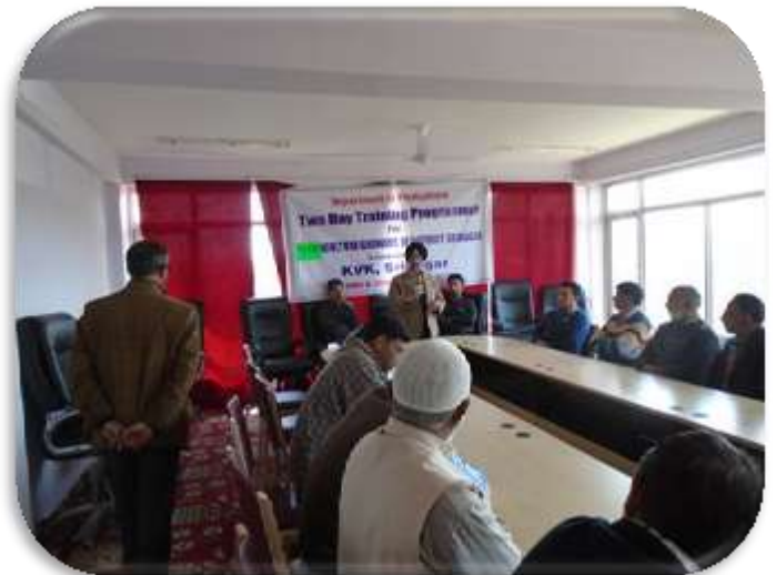
Training programme for floriculture growers of District Srinagar in collaboration with Dept. of Floriculture Srinagar