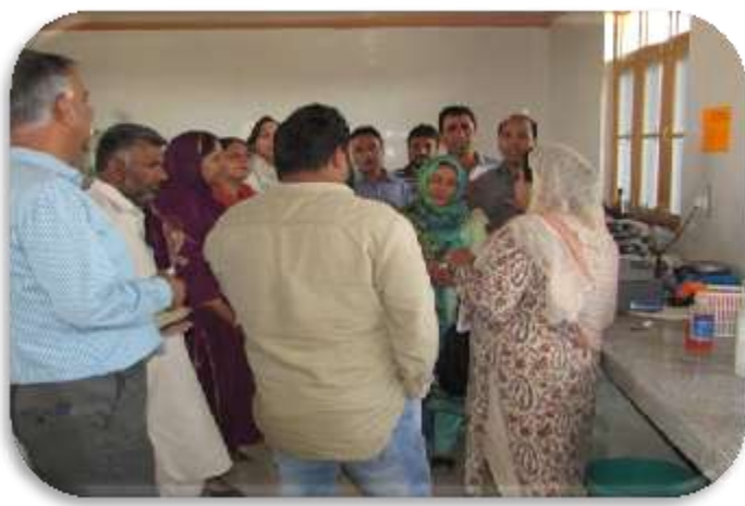
Practical Demonstration of Soil Testing Lab at KVK Srinagar