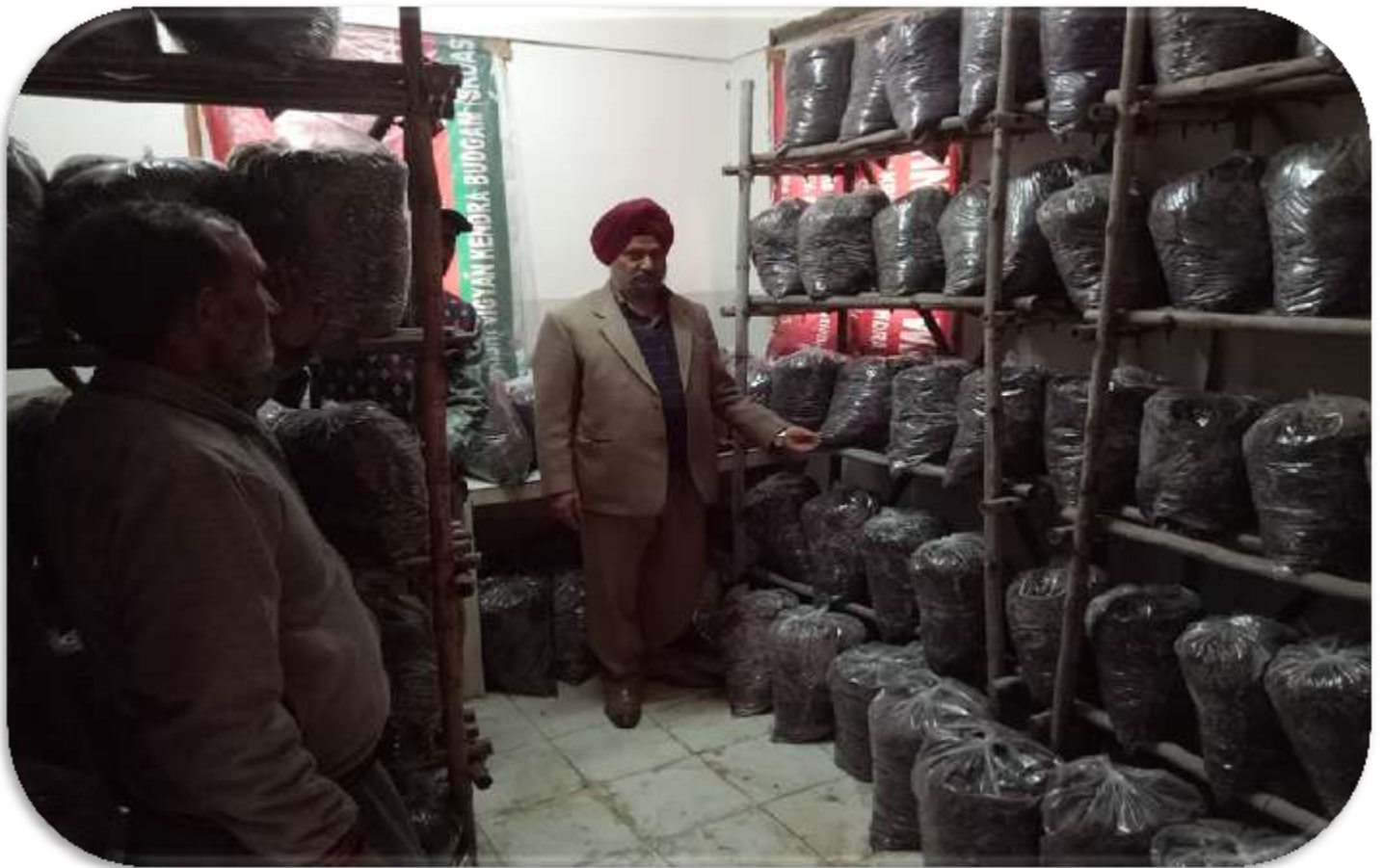
Button Mushroom Cultivation at KVK Campus