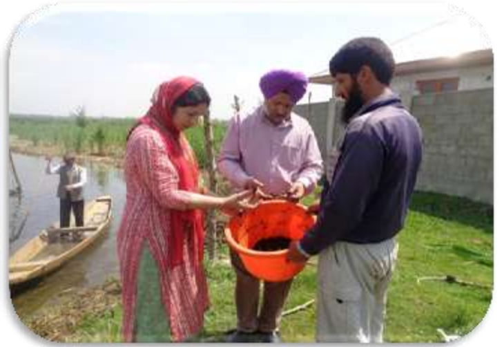
Planting of Nadroo and Tropa in Water Logged Area of KVK