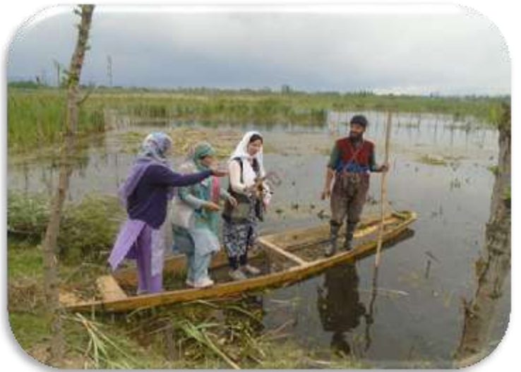
Establishment of Floating Gardens at KVK