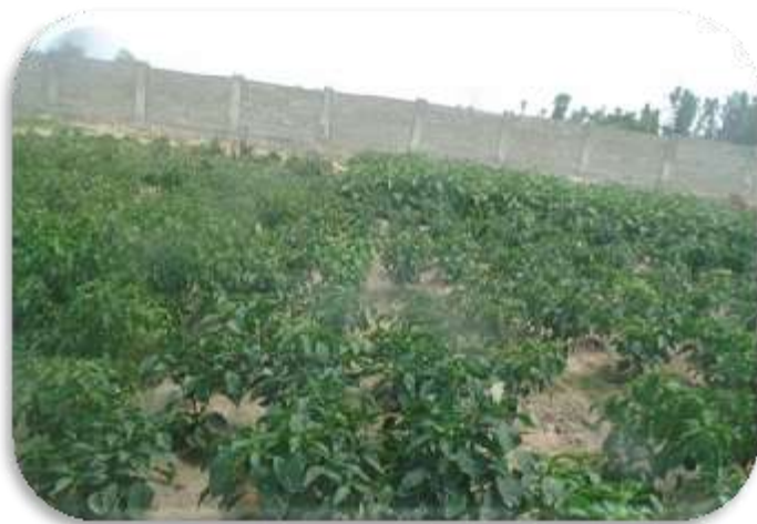
Crop: Capsicum Variety: Nishat