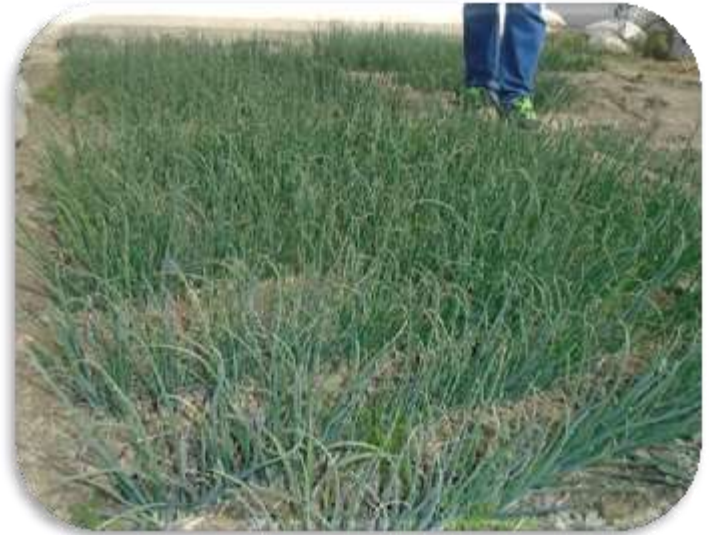
Onion Seedlings Variety: Brown Spanish and Yellow Globe