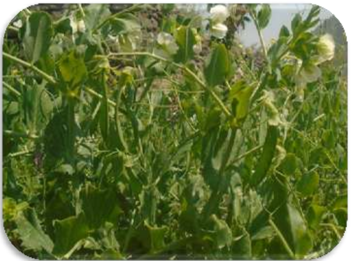
FLD Monitoring on Brown Sarson/Peas 2016-17