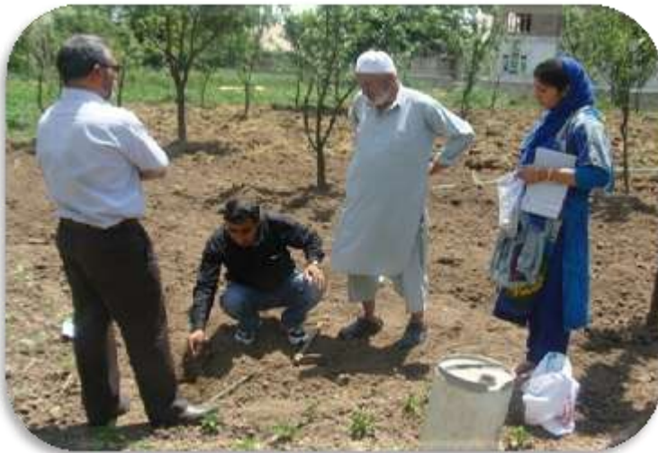
Demonstration on Vegetable Production (Okra) at village Khonmoh