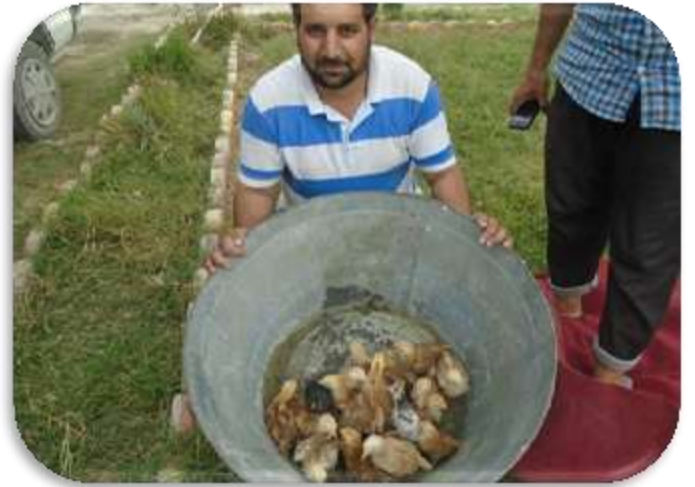
Distribution of Poultry Birds variety Rhode Island Red