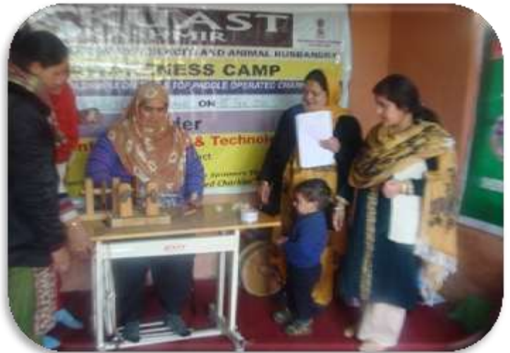
Popularization of Innovative Charkas