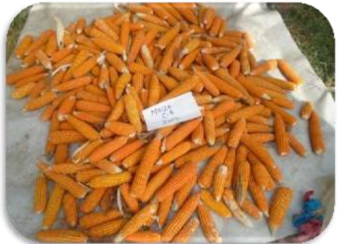
Maize Cobs of C-4 Variety