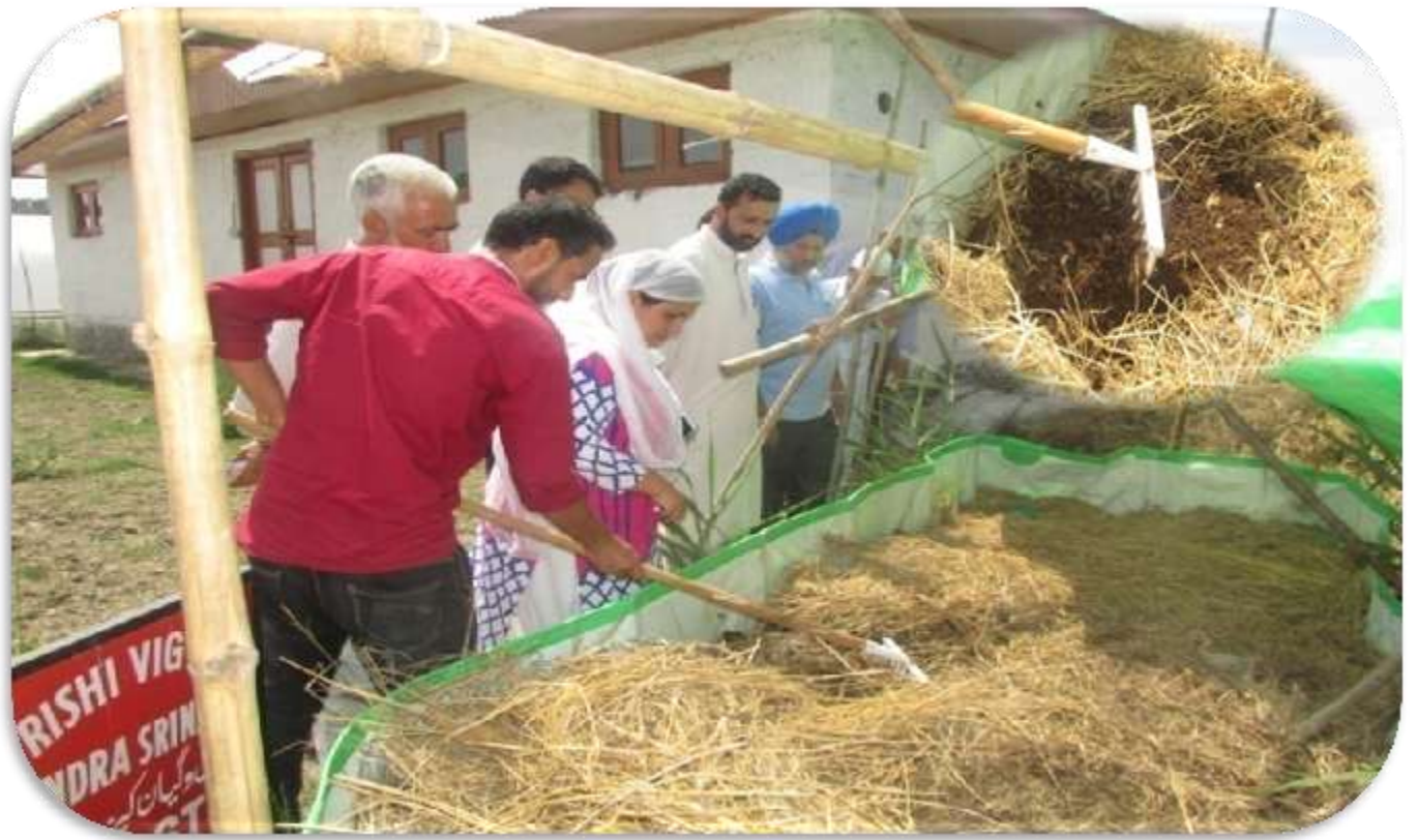
Vermi-composting Demonstration at KVK Campus