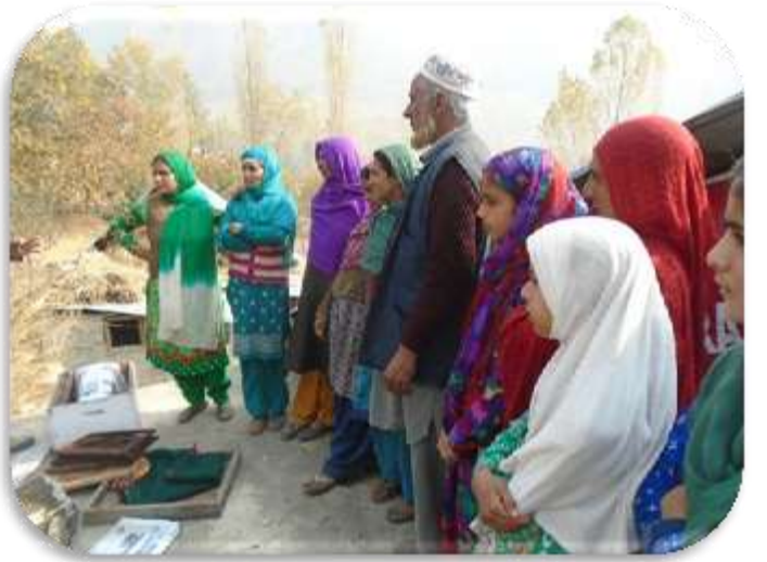
Management of Honey Bee at village Faqirgujri