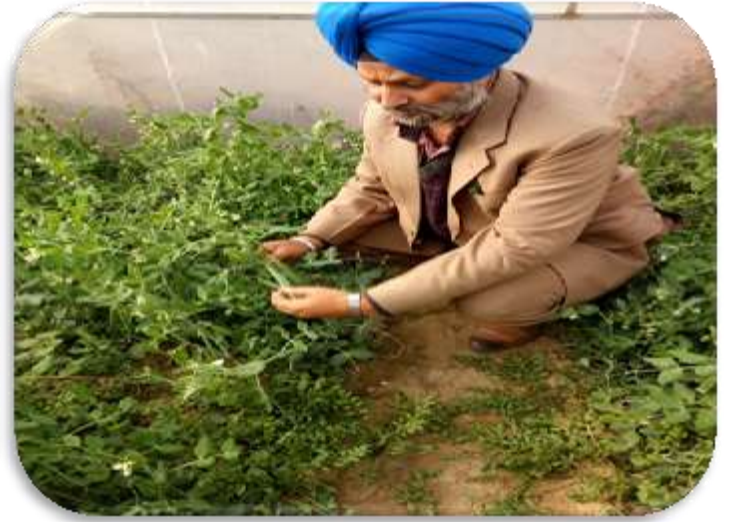
Off-Season Pea Cultivation in Protected Conditions at KVK Farm Date of Sowing: 31-08-2017