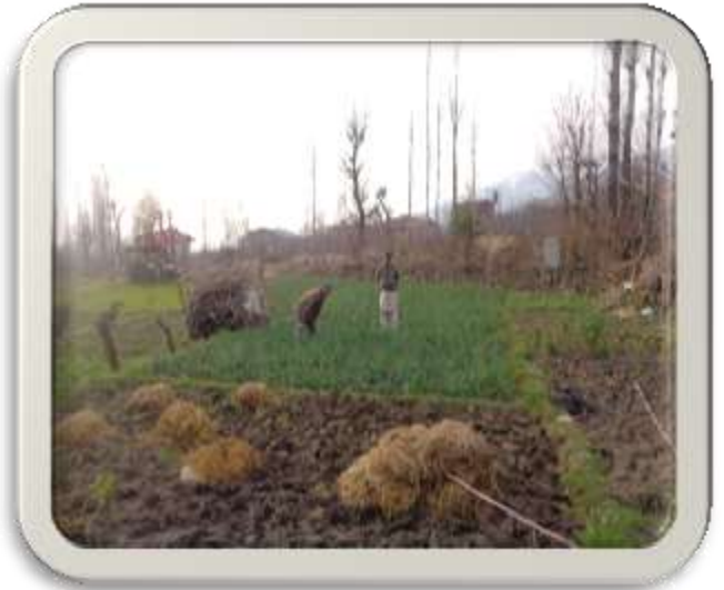
Monitoring of Onion Crop at village Darbagh