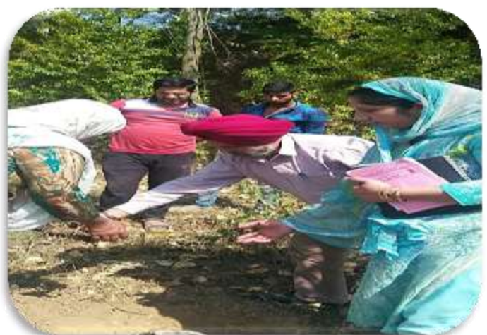
Collection of Soil Samples at different locations of District Srinagar