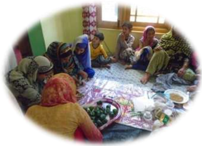
Preservation of Fruit and Vegetable at Village Gulzarpora