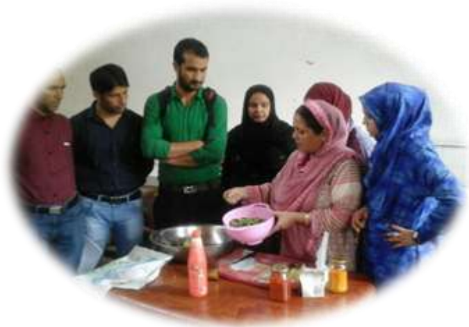
Processing and Preservation of Fruits and Vegetables (Canning Centre Lal Mandi)