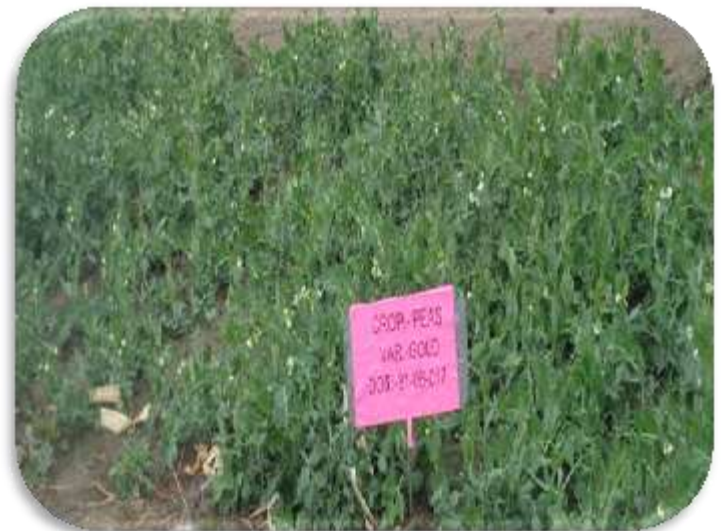
Pea Cultivation in Open Field Conditions at KVK Farm