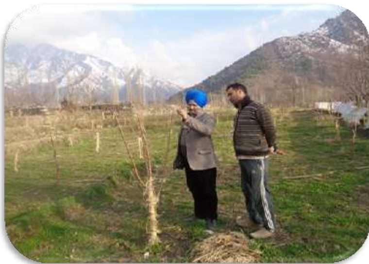
Interaction with Farmer growing Cherry at village Darbagh