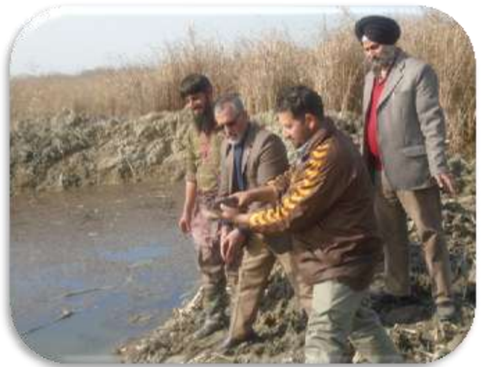
Introduction of Local Carp (Fish) in newly developed Fish Pond