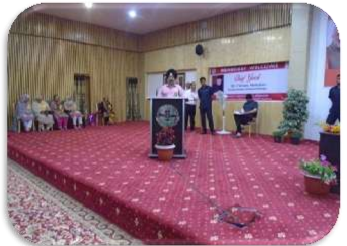
Name of Programme: Sankalp Se Siddhi Venue: Nundreshi Hall, SKUAST-Kashmir