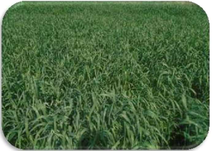
FLD Monitoring on Oats 2016-17