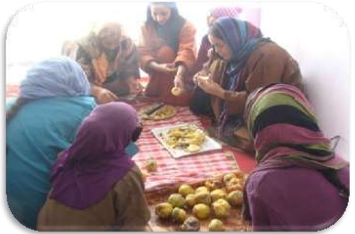
Skill Development programme on Quince Muraba Making