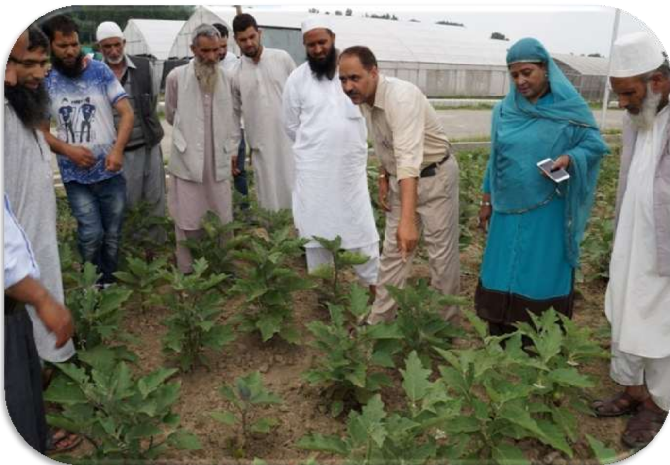
Farmers Training for Hybrid Seed Production at SKUAST-Kashmir