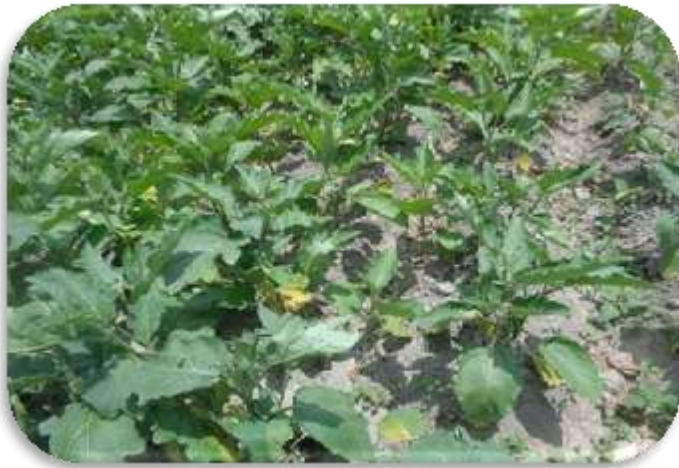
Crop: Brinjal Variety: Local Long