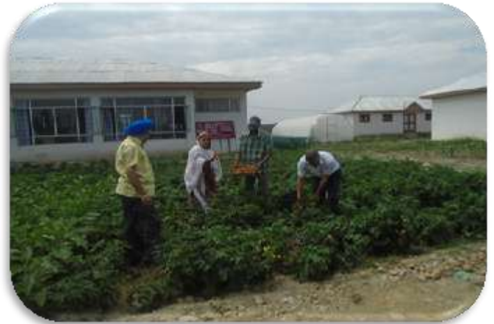
Crop: Tomato Variety: S2