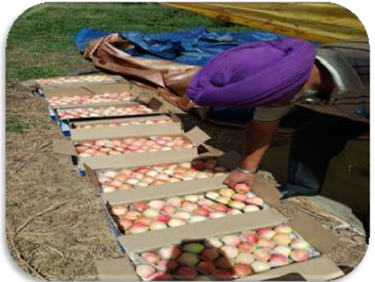
Farmers Training in Grading and Packing of Apple at Zakura