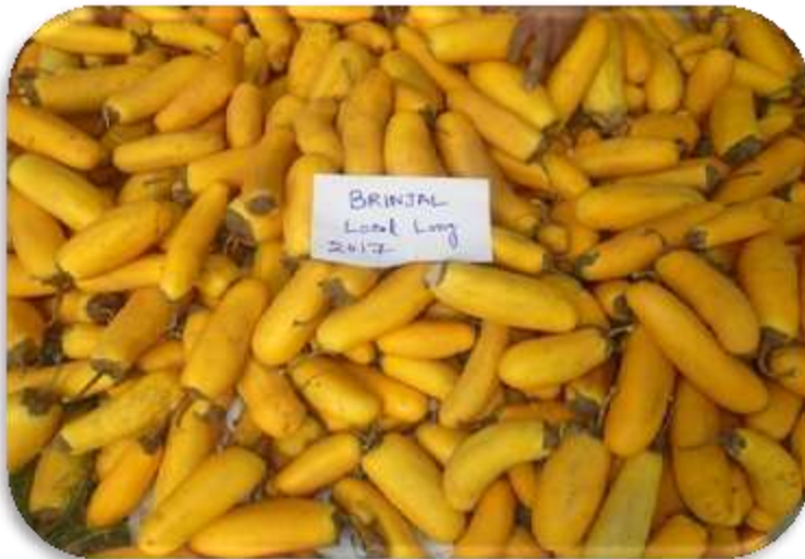
Brinjal for Seed Production Variety: Local Long