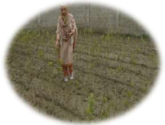
Fruit Nursery Planted at KVK Farm