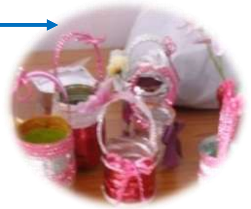
Training Programme on Jute Making and Decoration items out of Waste at KVK Campus