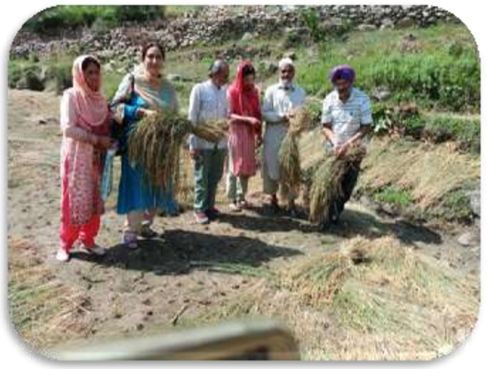
FLD on Paddy (Variety-K332) at village Faqirgujri