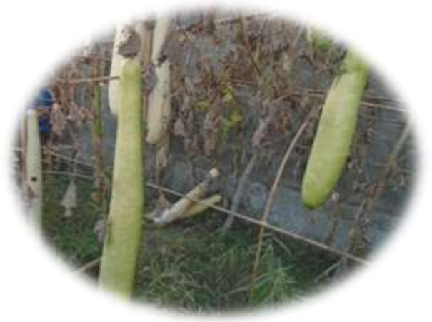
Bottle Gourd for Seed Production